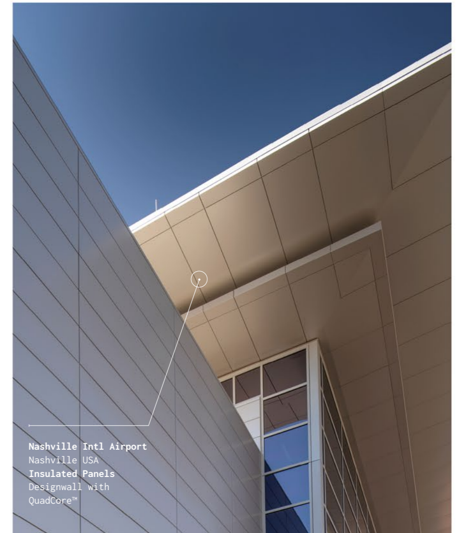
Nashville Intl Airport Nashville USA Insulated Panels Designwall with QuadCore™